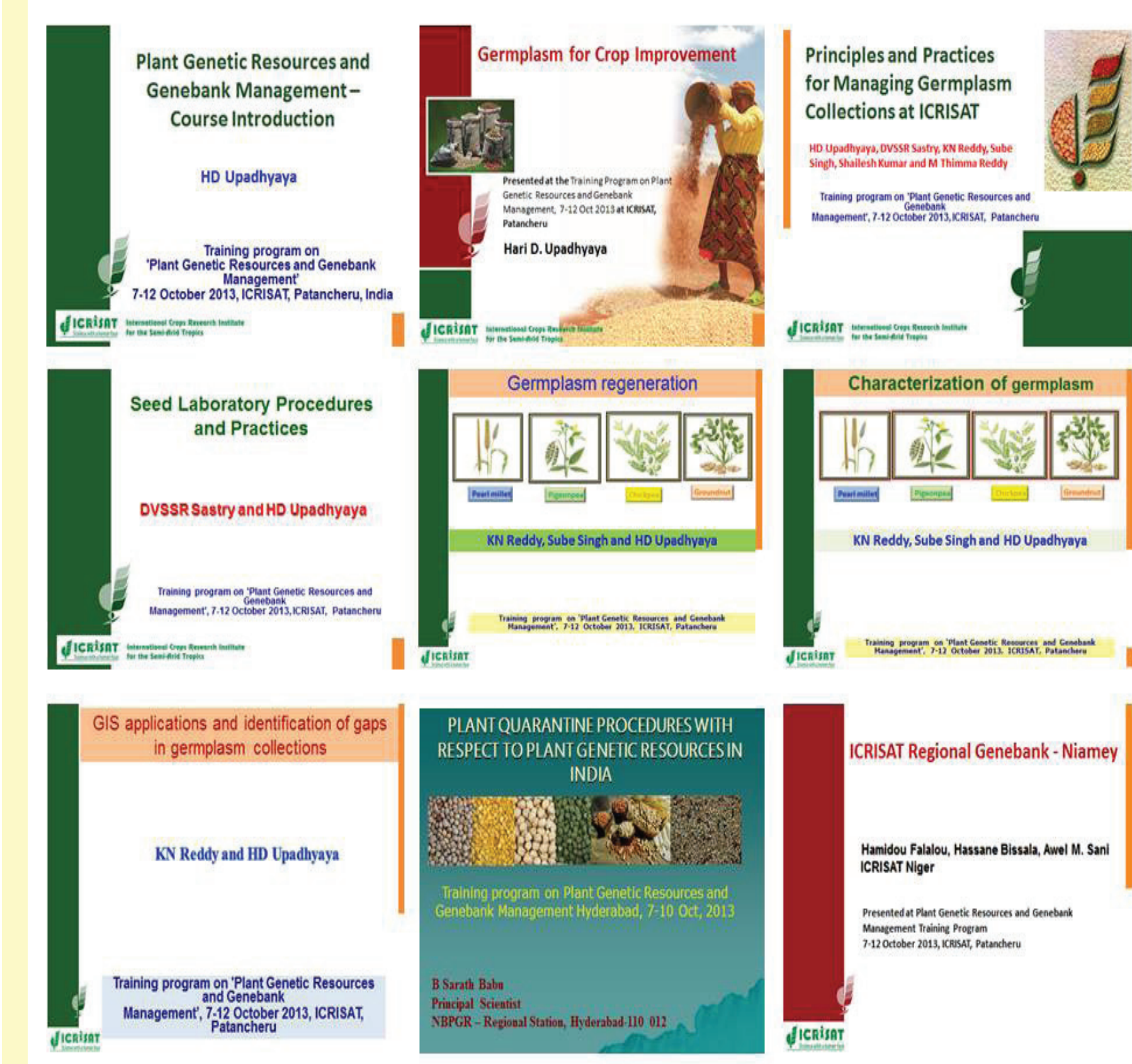
Course contents of training program on Plant Genetic Resources and Genebank Management, 7-12 Oct 2013, ICRISAT, India.