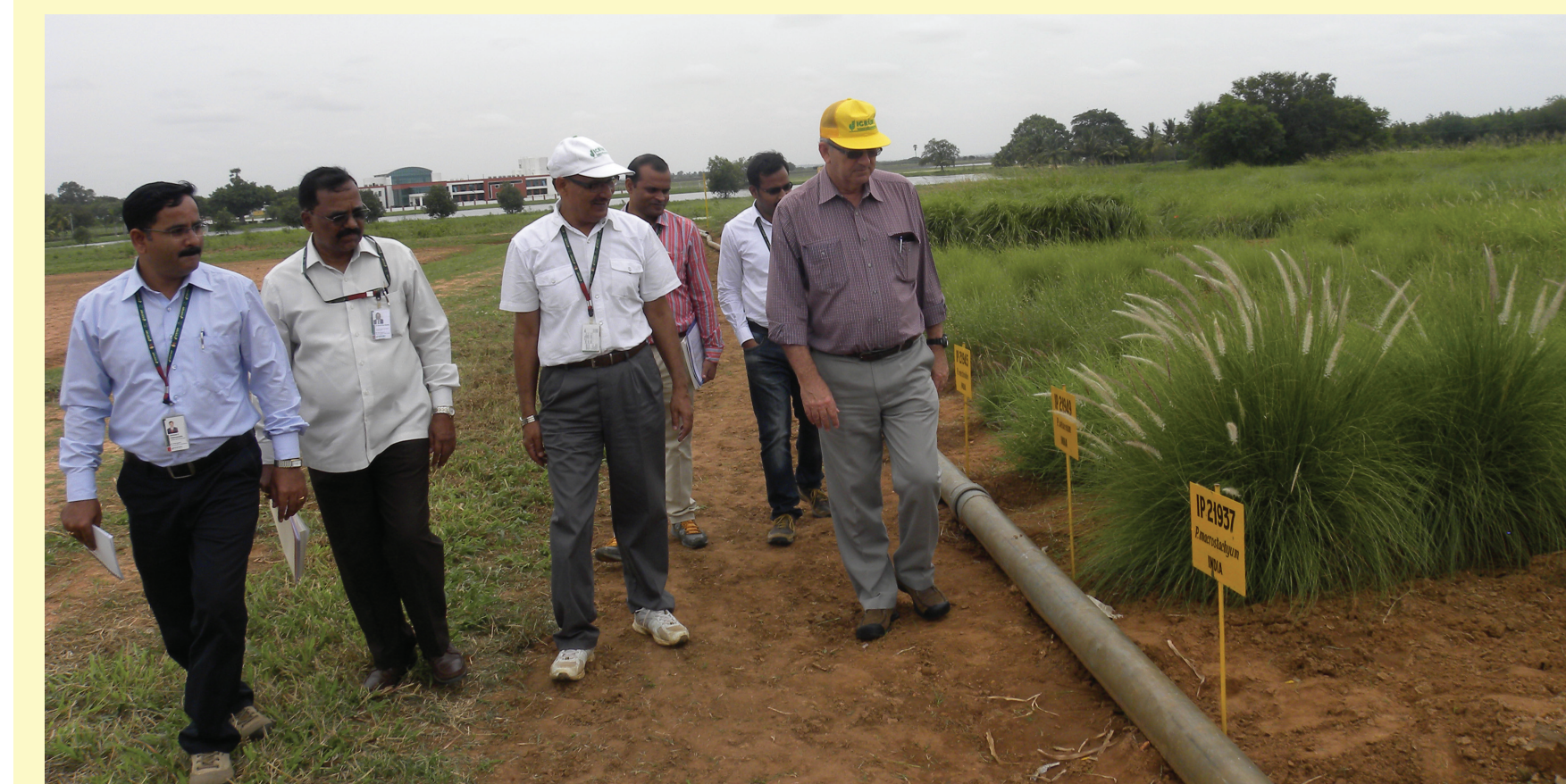
External Program and Management Review panel members visiting the field genebank.