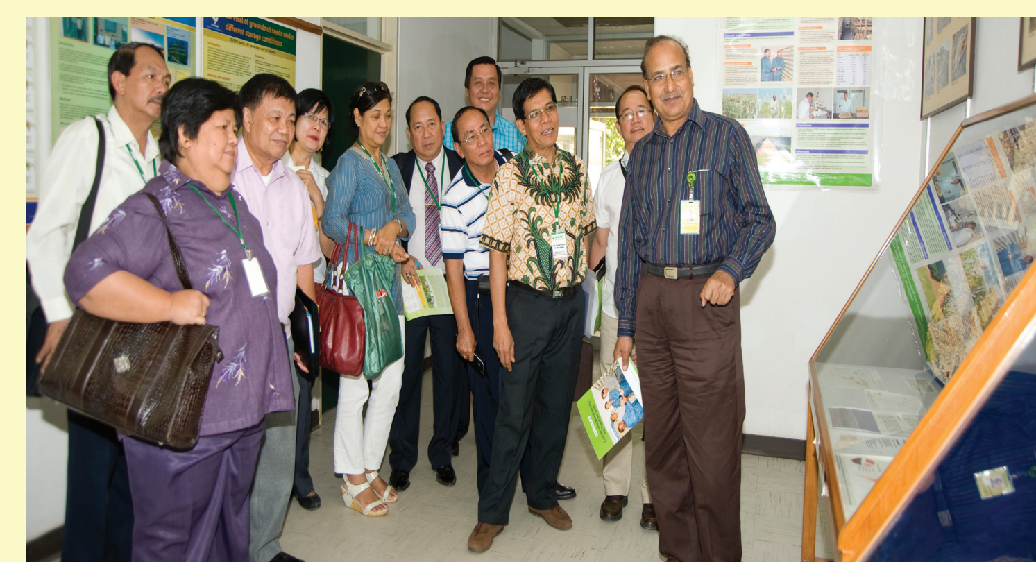
Executive Directors of Agriculture from the Philippines visiting ICRISAT genebank India.