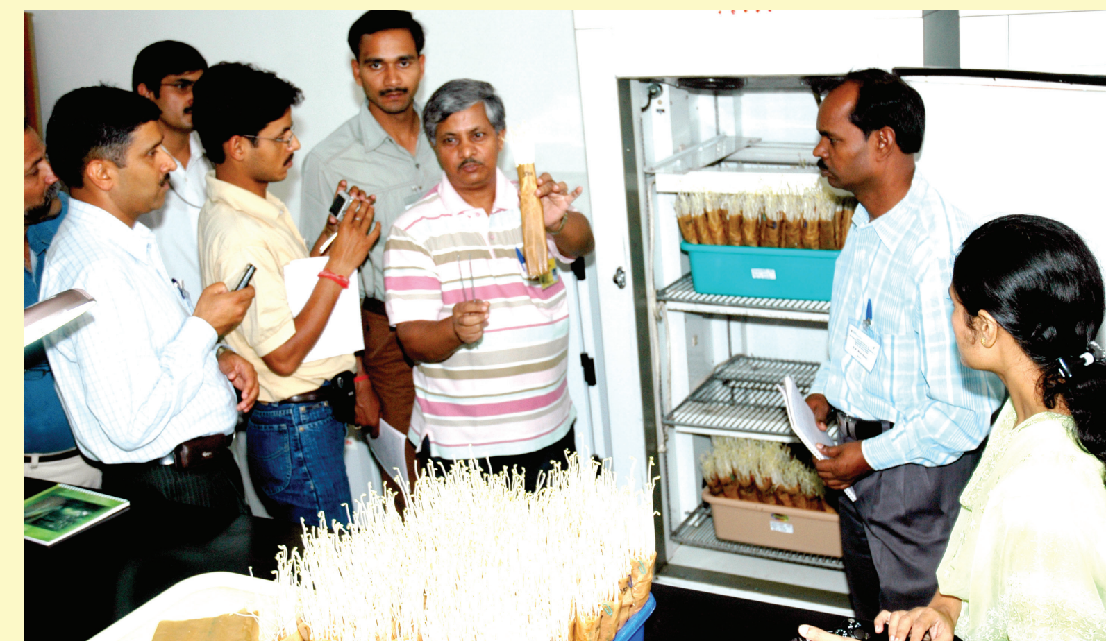
Training NARS scientists on viability testing.