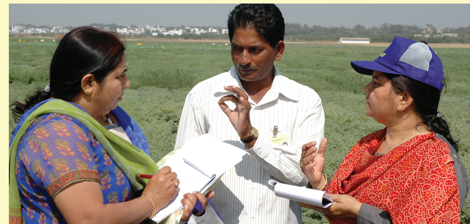
Training on chickpea germplasm characterization.