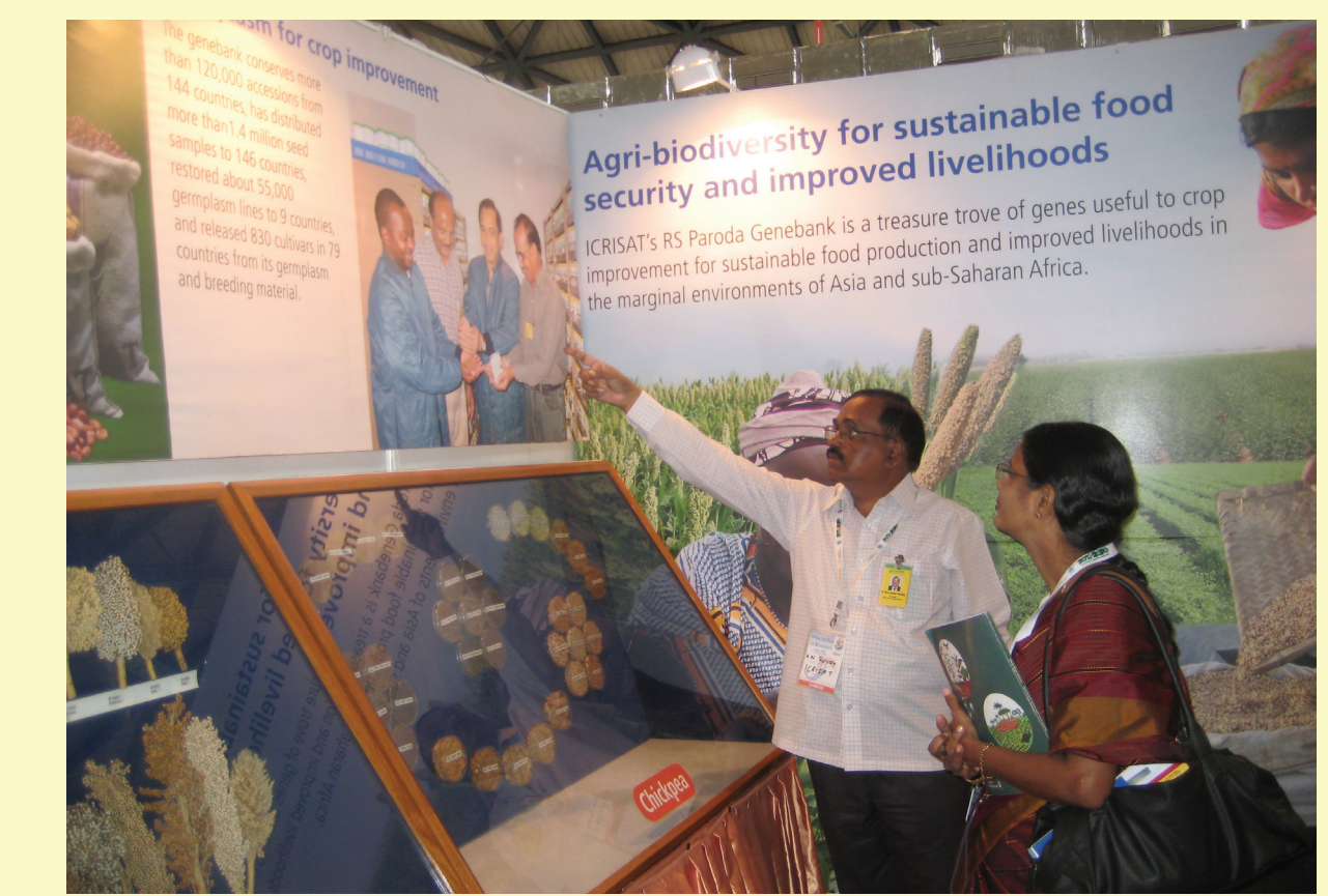
ICRISAT Stall at COP 11 Interactive Fair for Biodiversity 1-5 October, 2012.