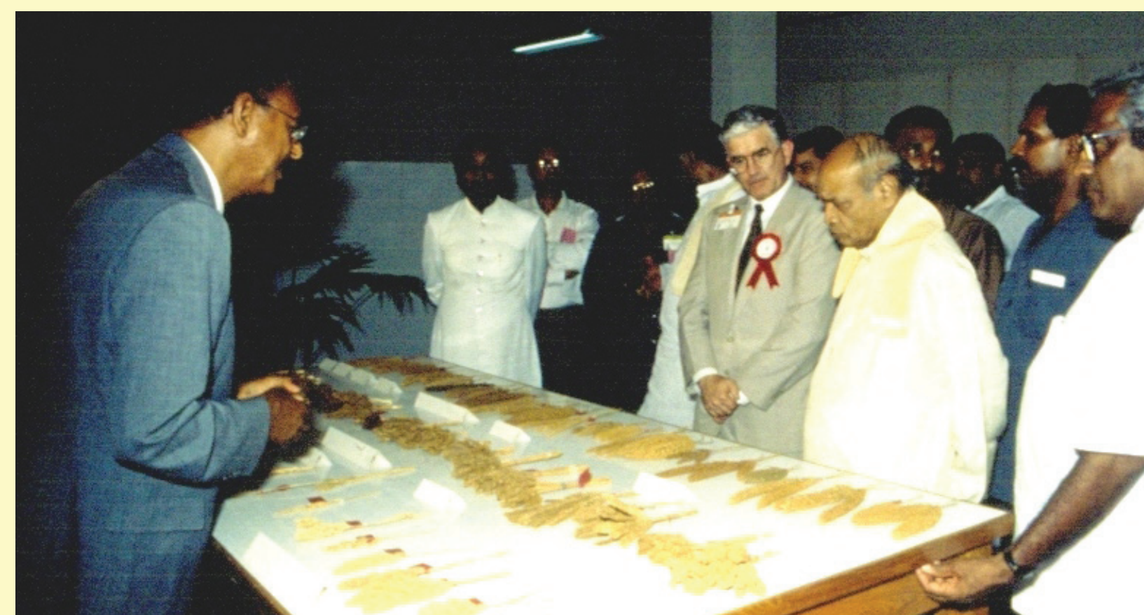
Mr PV Narasimha Rao (Late), Honorable Former Prime Minister of India, visiting the ICRISAT genebank