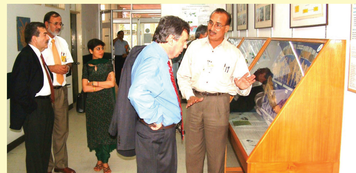
Senior Vice-President of the World Bank keenly observes the diversity in germplasm collections.