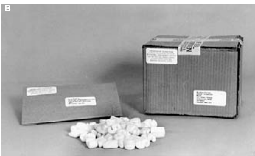
Figure 6A.1. Seed packets (A) and containers (B) used for seed distribution at ICRISAT genebank.