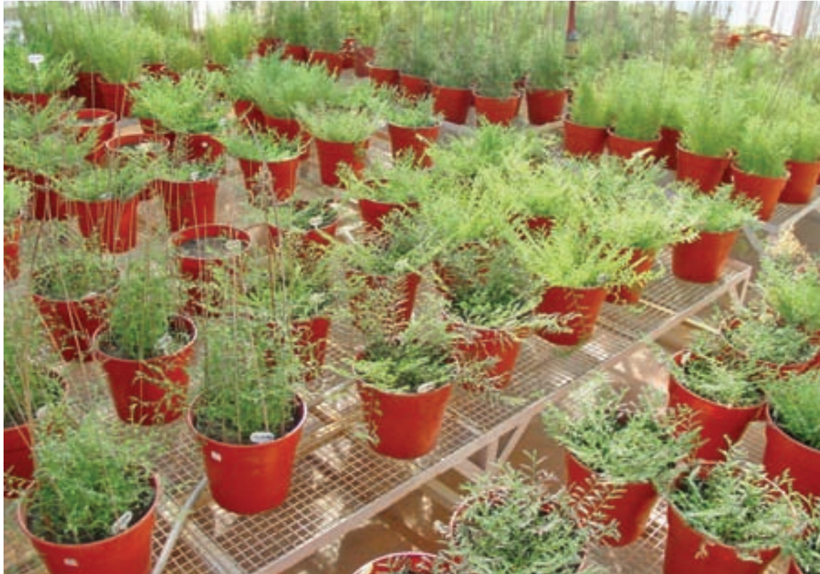
Figure 9E.1. Regeneration of chickpea wild relatives in plastic pots kept in a glasshouse.

Chickpea wild relatives are regenerated in a glasshouse (Fig. 9E.1). Raise seedlings in small pots and then transfer them to big pots or to the field. Pasteurize the soil mixture to protect plants from soil borne diseases such as wilt and collar rot.