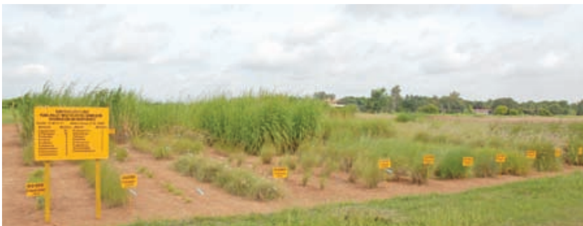
Figure 9D.3. Maintenance of perennial, non seed producing Pennisetum species at ICRISAT, Patancheru.