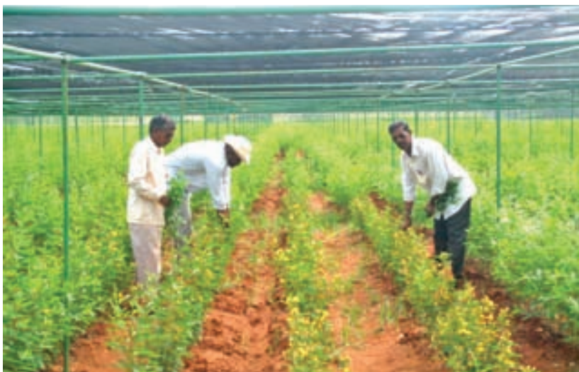
Figure 9F.2. Roguing in pigeonpea germplasm grown for regeneration under insect proof cages at ICRISAT, Patancheru, India.