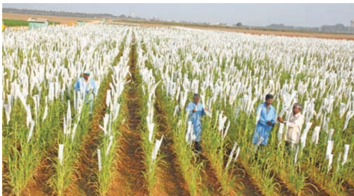
Figure 9D.1. Field view of pearl millet germplasm regeneration.

Out-crossing in pearl millet germplasm is controlled by cluster bagging, selfing and sibbing. Landraces are maintained by cluster bagging, genetic stocks by selfing, and male sterile lines by sibbing (Fig. 9D.1).