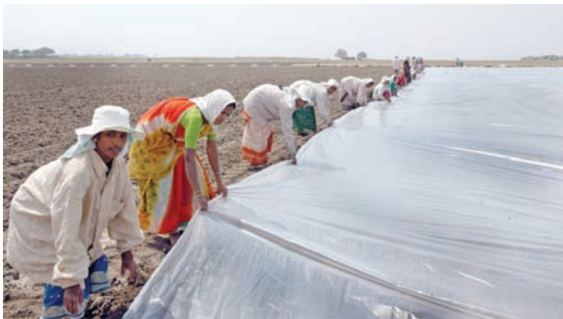
Figure 9B.1. Covering the field with polythene sheet to solarize soil for chickpea germplasm regeneration at ICRISAT.