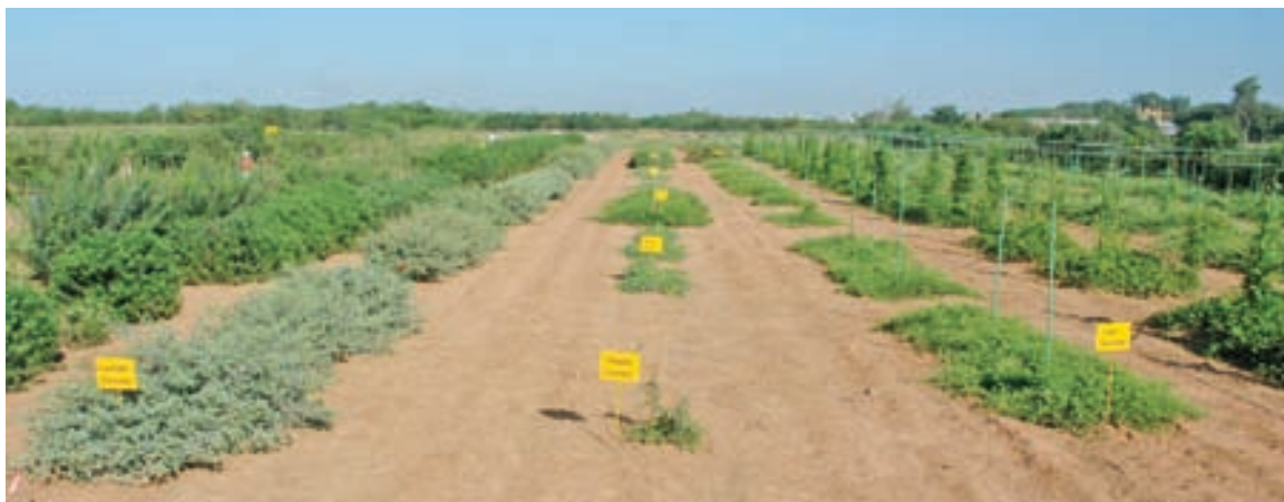
Figure 9F.3. Wild relatives of pigeonpea grown for regeneration in field genebank at ICRISAT, Patancheru, India.

Pigeonpea wild relatives are regenerated in the field genebank (Fig. 9F.3). Raise seedlings in small pots and then transfer them to big pots or to the field. Pasteurize the soil mixture to protect plants from soil borne diseases such as wilt and collar rot.