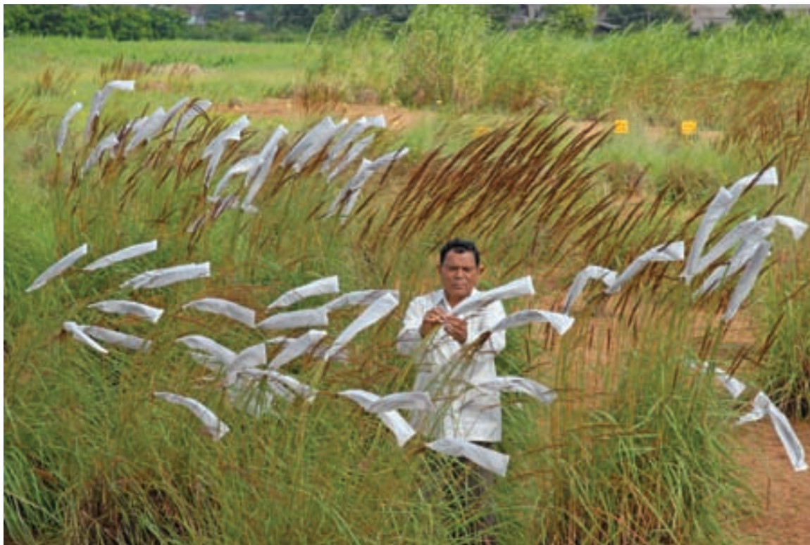
Figure 9C.2. Bagging panicles of sorghum wild relatives during regeneration.