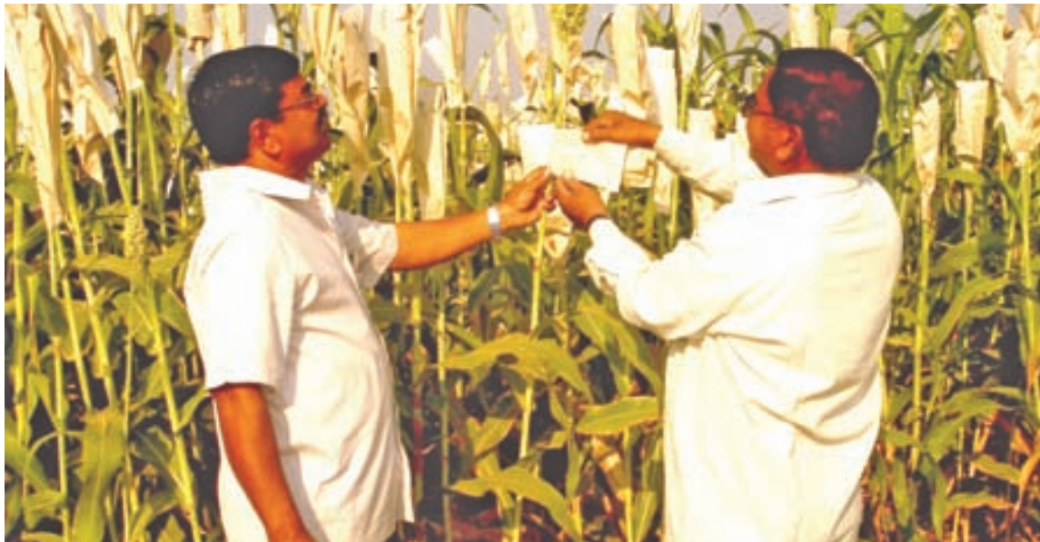
Figure 9C.1. Clasp paper bags around peduncles to identify selfed panicles.