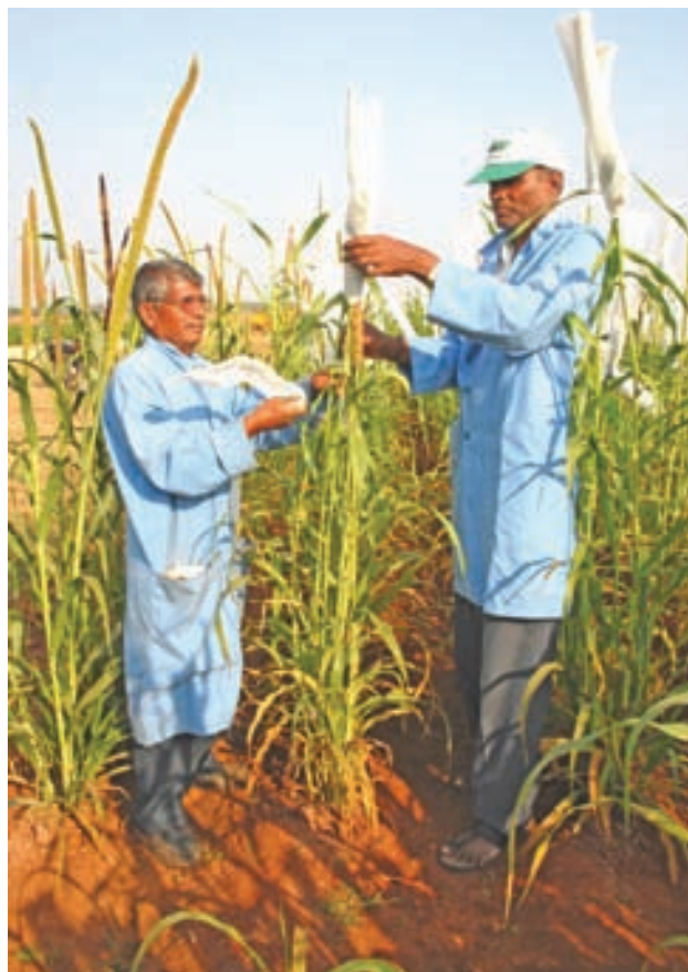
Figure 9D.2. Cluster bagging method of pollination control in pearl millet.