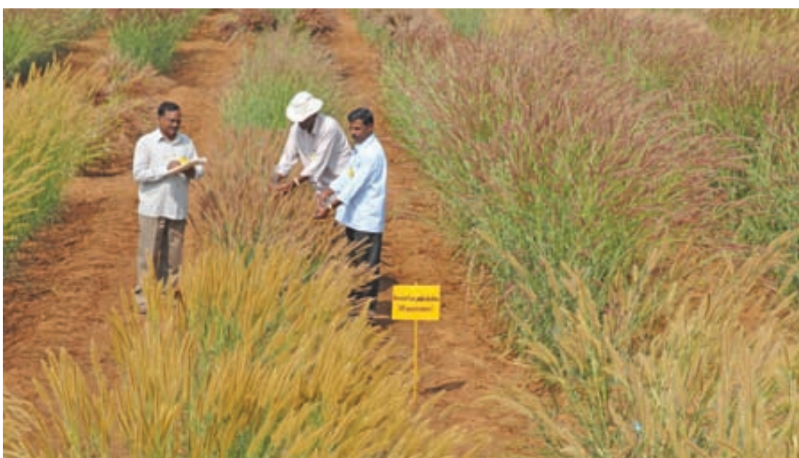
Figure 9D.4. Pennisetum polystachion grown for regeneration and characterization at ICRISAT, Patancheru.