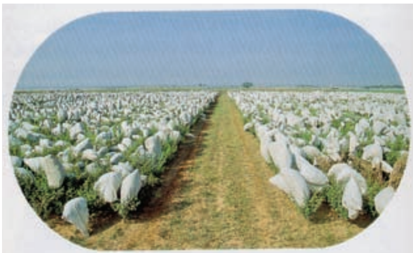
Figure 9F.1. Pigeonpea plants bagged to avoid cross-pollination during regeneration at ICRISAT, Patancheru, India.