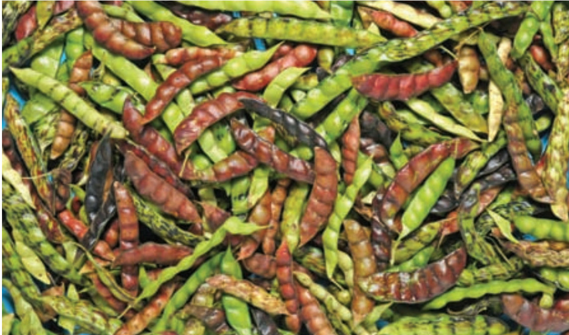
Figure 3. Diversity for pod color in pigeonpea germplasm at ICRISAT genebank.

Seeds per pod : Number of seeds per pod, determined from 10 pods randomly picked from three plants at harvest maturity.