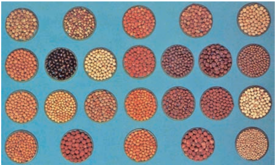
Figure 5. Diversity for seed color in pigeonpea germplasm.

Secondary seed color : Eventual other color on the seed coat, coded as in primary seed color.