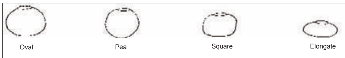
Figure 6. Seed shape in pigeonpea.

Seed hilum : Presence or absence of strophiole.