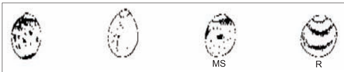
Figure 4. Seed color pattern in pigeonpea.